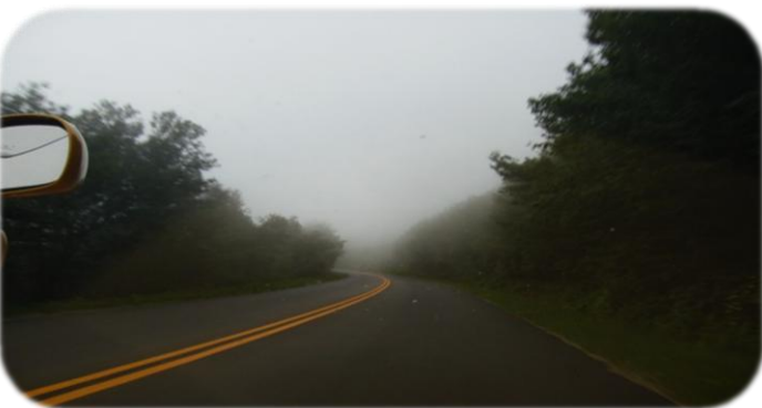
Blue Ridge Parkway